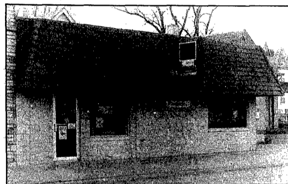
COMPLETE COMPUTER Systems, Inc. is located at 318 Main